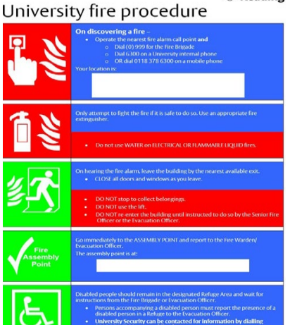
Fire Action Notice