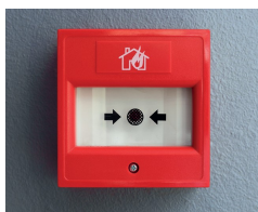
Fire alarm call point