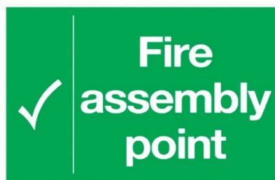
Fire assembly point sign