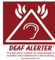
Deaf Alerter sign