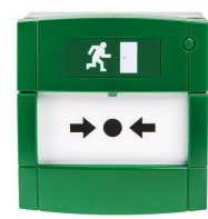
Green emergency door release