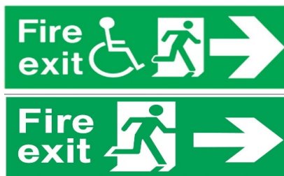
Fire exit sign and wheelchair-friendly fire exit route sign