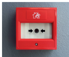
Fire alarm call point