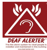
Deaf Alerter sign