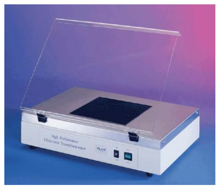
Fig\ 2a.\ A\ typical\ transilluminator, showing\ the\ raised\ shield\ at\ the\ front\ of\ the\ flat\ bed

Perspex screen should always cover the gel so that the operator is not exposed, unless it is necessary to cut out one or more bands from the gel. The design of the instrument should be such that the shield is hinged at the front of the bed, and is raised towards the operator. Any existing transilluminator not already equipped with a shield attached in this way should be modified accordingly. See Figs. 2a and 2b