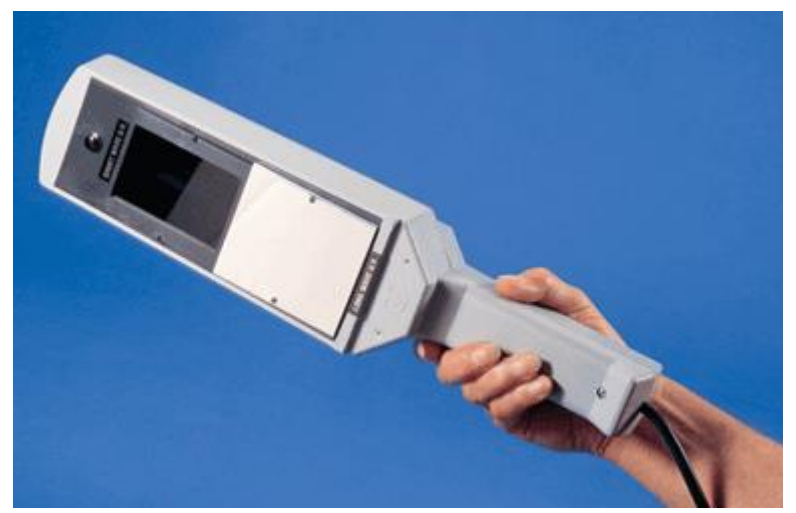
Fig 3. Hand-operated UV lamp (can be bench mounted)

Typical lamps, (fitted with glass filters), have effective irradiances in the range 4-60 \mu Wcm<sup>-2</sup> at 1 m, with a typical wavelength of approx 350 nm (some models may have two or more wavelength peaks, selectable by switching.) The effective irradiation increases when the filter is removed.