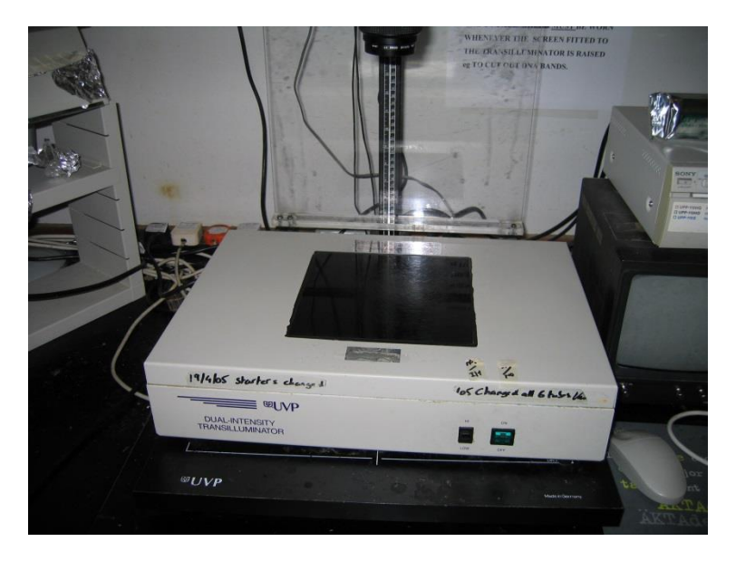
Fig 2b: Transilluminator with shield wrongly fitted at the back of the bed

Note the viewing area in the centre of the bed. Users should be aware of escape of UVR from the sides of the instrument when the shield is raised, and avoid placing any articles with shiny reflective surfaces close to the instrument. Ideally, the instrument should be operated in an enclosure with dark matt surfaces to the sides and rear.