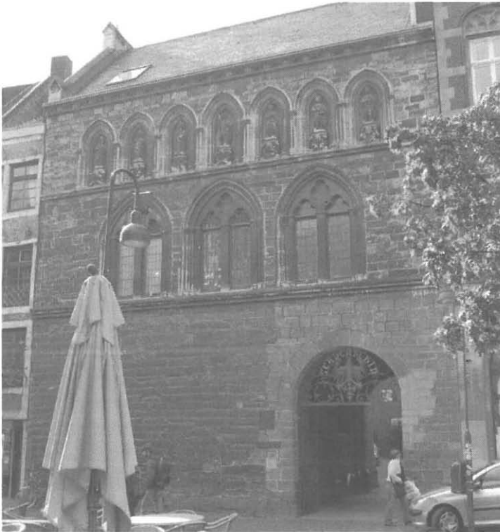
Figure 4: The Aachen Grashauss in the Fischmarkt, built in 1267. Now housing the city-archives, it was the town-hall before the restoration of the ancient Carolingian aula for this purpose in the late fourteenth century. It is heavily restored and the statues of the seven electors are modern replacements of statues known from early drawings.*

city archives. 58 This was a magnificent building, decorated with statues of the seven electors of the king of the Romans (figure 4), so that Richard's part in it may have been another aspect of his policy of elevating Aachen's status as a coronation-city.