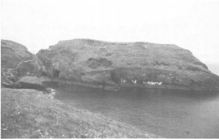
Figure 1: The promontory of Tintagel from the east across the Haven. The sharp nick in the skyline on the left-hand side of the photograph is where the saddle of rock once existed but has now collapsed. The 'island courtyard' of the castle is visible just to the right of it, while the 'lower mainland courtyard' is on the summit on the left of the photograph.

Geoffrey of Monmouth's description of Tintagel, as put into the mouth of one of Uther Pendragon's followers, corresponded with the site as it actually existed, suggesting that Geoffrey knew it at first hand: 'That fortress is surrounded by sea on three sides, and there is no means of access other than a narrow causeway'. This would have made it possible for Richard of Cornwall, his entourage, and perhaps his important guests vividly to envisage the events described by Geoffrey of Monmouth as they looked at the newly built castle. Maybe they were even able to play out the Arthurian legends, in the same sort of way as the Little Castle was probably used at the great seventeenth-century house of Bolsover. As Mark Girouard comments, 'its mock fortifications, vaulted rooms, carved chimney-pieces and statue of Venus at the centre of a crenellated garden enclosure' make it 'essentially a more solid version of the pasteboard castles that were erected as part of the entertainments put on to celebrate royal events', 7 entertainments which may well have included enactments of Arthurian legends.