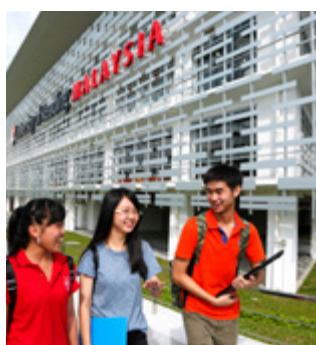
University of Reading Malaysia campus at EduCity@Iskandar