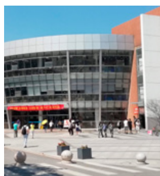
A joint Academy with the Nanjing University of Information Science and Technology, China