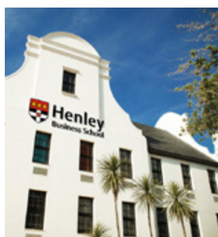
Henley Business School South Africa in Johannesburg

Places of Reading reach many thousands of miles beyond the town itself