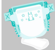
nappies & sanitary products