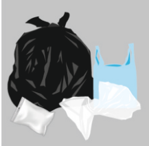
plastic bags, film & wrapping

Please don't put these items in your recycling bin