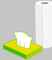
tissues, wet wipes & kitchen towels