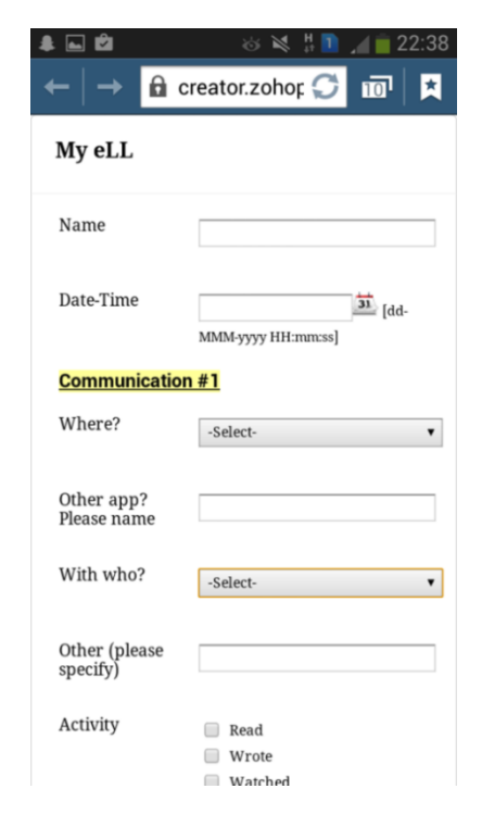
Figure 1. The electronic literacy log as it appeared on participants' phone screens