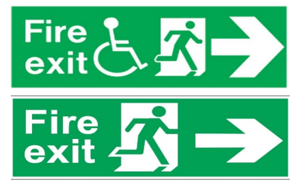
Fire exit sign and wheelchair-friendly fire exit route sign