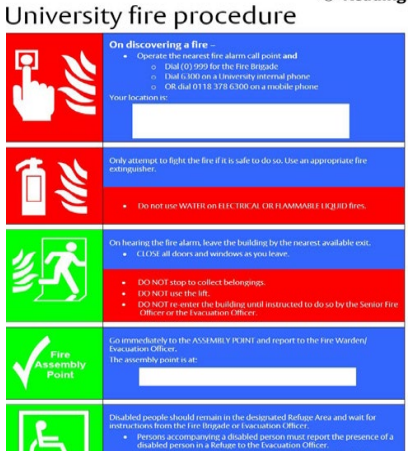
Fire Action Notice