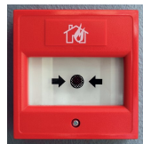
Fire alarm manual call point