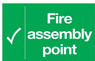
Fire assembly point sign