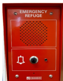
Commend refuge communications intercom