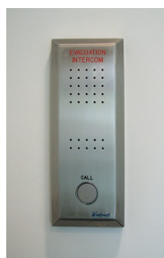
Windcrest refuge and lift communications intercom