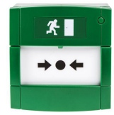
Green emergency door release