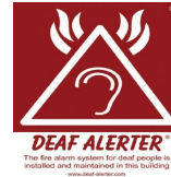
Deaf Alerter sign