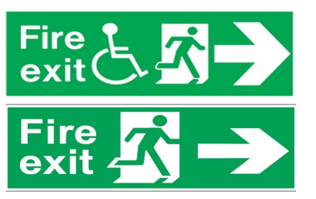
Fire exit sign and wheelchair-friendly fire exit route sign