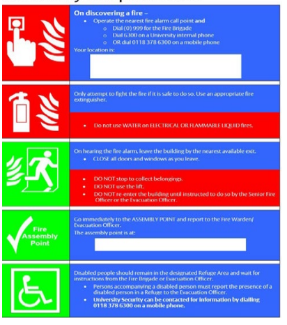
Fire Action Notice