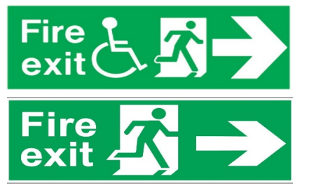
Fire exit sign and wheelchair-friendly fire exit route sign