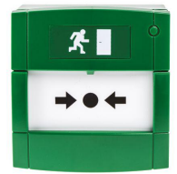
Green Emergency door release