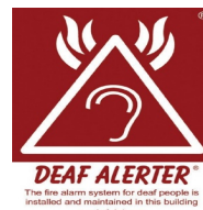
Deaf Alerter sign