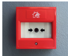
Fire alarm call point