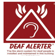
Deaf Alerter sign