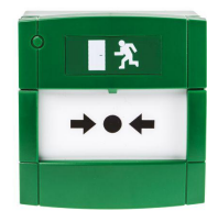
Green emergency door release.