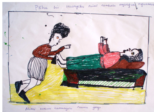
Figure 1: 'This picture shows me caring for my mum when she was ill', drawing by Neema (aged 18) who cares for her mother with HIV and three younger siblings.