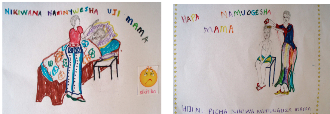
Figure 4: ‘This is me giving my mum porridge. I feel sad. Here I am giving my mum a shower. These are pictures of me caring for my mum’ (Drawings by Magdalena, aged 15, in Tanzania, who cared for her mother until she died).

(aged under 18) interviewed in Tanzania were providing care for their mothers/ female relatives as the number of girls, contrasting with the UK sample, and some provided personal care for their mothers, despite the fact that this subverted dominant gender norms.