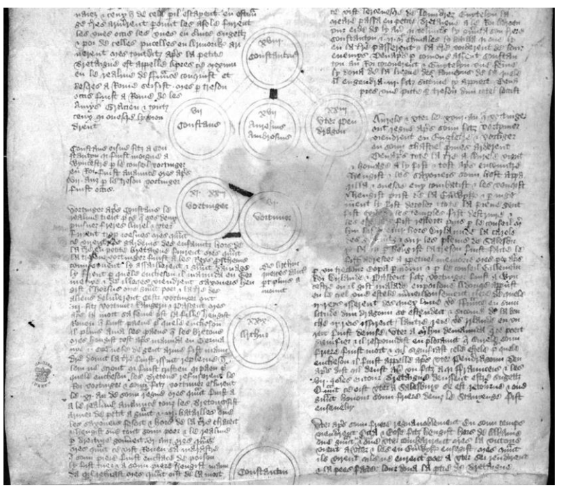
Figure 2: London, BL, Add. 8101

The Anglo-Norman genealogical rolls of the kings of Britain also stress the positive consequence of the adultery -the birth of Arthur. Oxford, Bodleian, Add. E 14 (early 14th c.)47 offers a synthetic but comprehensive summary: it evokes Uther's rapture for Ygerne, the circumstances of the duke's departure and the siege of Tintagel. Merlin's 'art' allows for the illegitimate conception of Arthur (whose name is introduced by two positive terms: '[Uther] parjut la cuntesse, si engendra le noble beer Arthur'); Gorlois' death finally enables the king to marry Ygerne. In this roll, the genealogy is structured on the right side by a diagram executed in red and brown ink containing the names of the successive British kings, with the commentary on the left side. Arthur features in two roundels, a double-entry system already set up by Matthew Paris and used above for King Constans. It is a common feature of genealogical rolls to represent twice the same character, first as son of a king, and then as sovereign, as if the acquisition of the royal dignity presented him with a new persona.