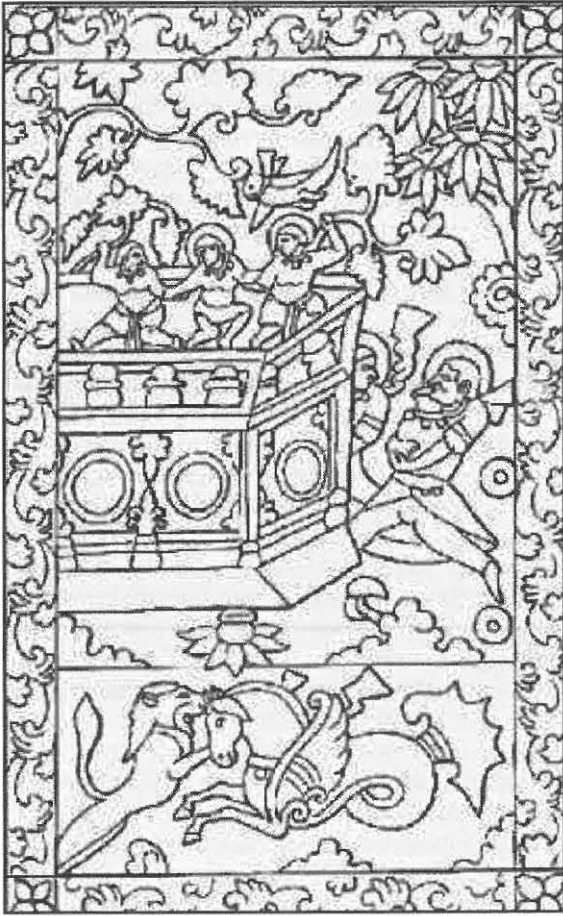
Fig. 2. Panel from Sui dynasty sarcophagus, said to depict the Byzantine Empire. Note vine-scroll and figures trampling grapes in a vineyard (After Shaanxi Archaeological Institute, 2001).

consciously adapted to specifically Chinese cultural norms or was misinterpreted as a circus motif.