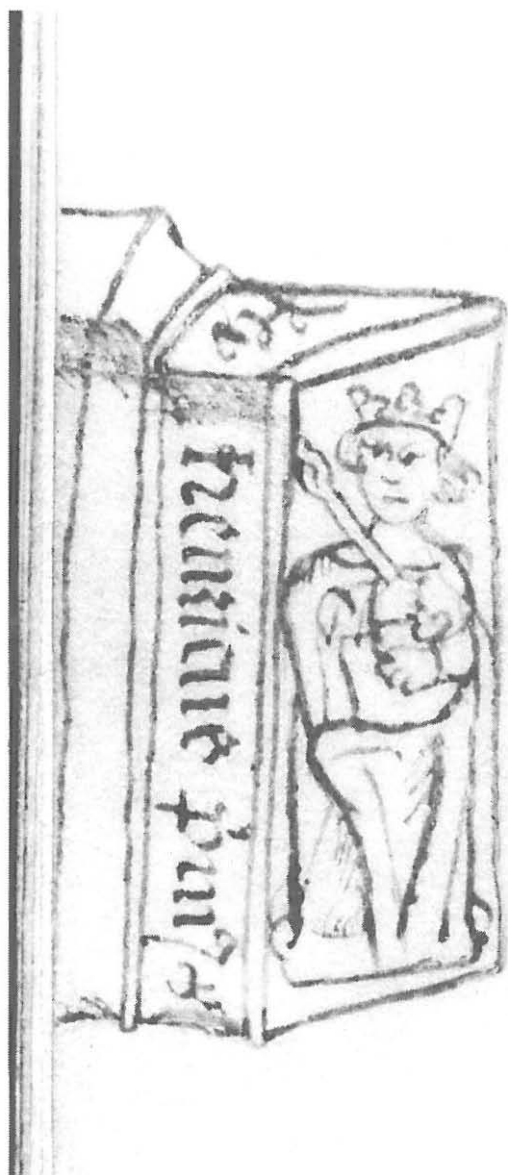
Fig. 1. Marginal illustration possibly representing the tomb of King Henry I at Reading Abbey in British Library Ms. Royal 20 A XVIII, fol. 172r. (Reproduced by permission.)