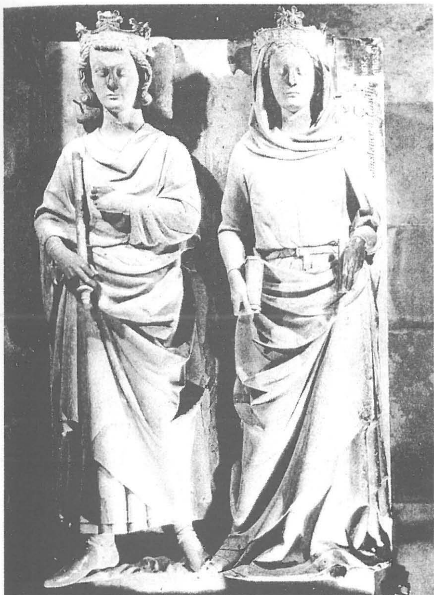
Fig. 4. Effigies of Philippe, son of King Louis VI of France, and Constance of Castile at St-Denis.