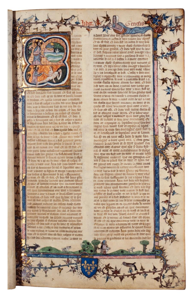
Fig. 1, Paris, Bibliothèque nationale de France MS fr. 1, f. 3r © Bibliothèque nationale de France.