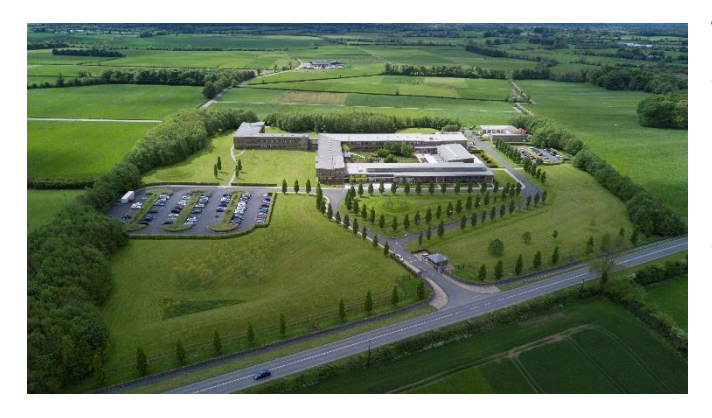
The Directorate for Health and food audits and analysis, Grange, County Meath, Ireland

The Directorate-General for Health and Food Safety develops and implements the Commission's policies on food safety and public health. The implementation and enforcement of EU legislation are essential for citizens to be confident that their interests are protected. The Directorate-General for Health and Food Safety has a specific Directorate that dedicates most of its resources to Commission controls.