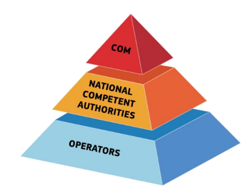
Figure 1: Levels of controls of EU safety standards in the Food domain

In the EU, operators in the agri-food chain (such as farms, slaughterhouses, food-processing establishments and importers) have the primary responsibility for ensuring compliance with EU safety standards. In turn, Member States' authorities are responsible for checking operators' compliance by means of official controls (e.g. inspections). Member States also have to set up a system to assure themselves that they carry out their official controls effectively and consistently. The Commission controls verify the effectiveness of Member States' official control systems.